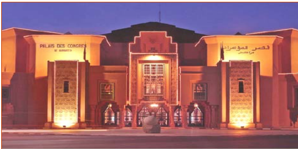
« Palais des Congrès » of Marrakesh

Marrakesh is the first tourist city in Morocco and has more than 150 hotels. Many hotels are located close to the “Palais des Congrès” and are sufficient to accommodate all participants at less than 15 minutes walk. Marrakesh is also well known by his Ryads which are traditional houses and palaces with luxury and modern comfort.